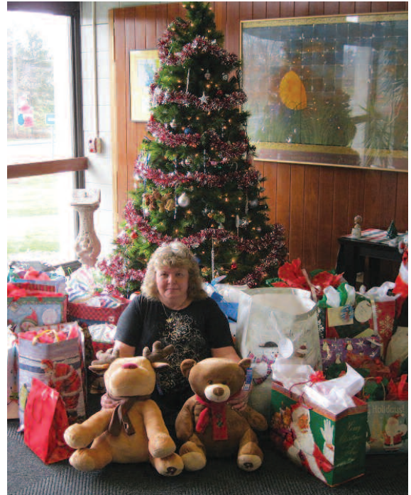
The University of Rochester Facilities & Services Team collected donations for CFC's clients.

Another special thanks to those businesses, community groups, and churches that helped make our clients' Christmases a little brighter.